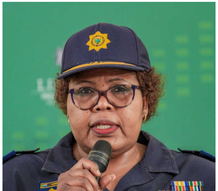
Lt. Gen. Thembi Hadebe.