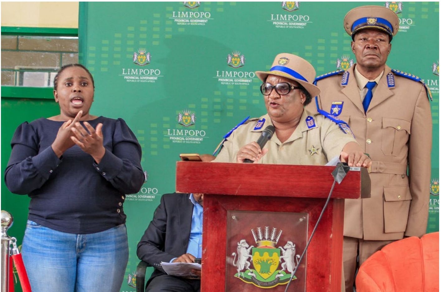
MEC Violet Mathye delivering keynote address.