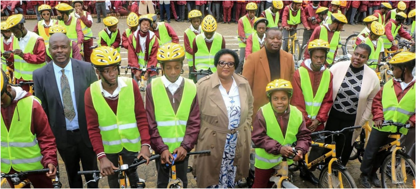
Learners of Vhafamadi Secondary School receiving the Shova Kalula Bicycles.