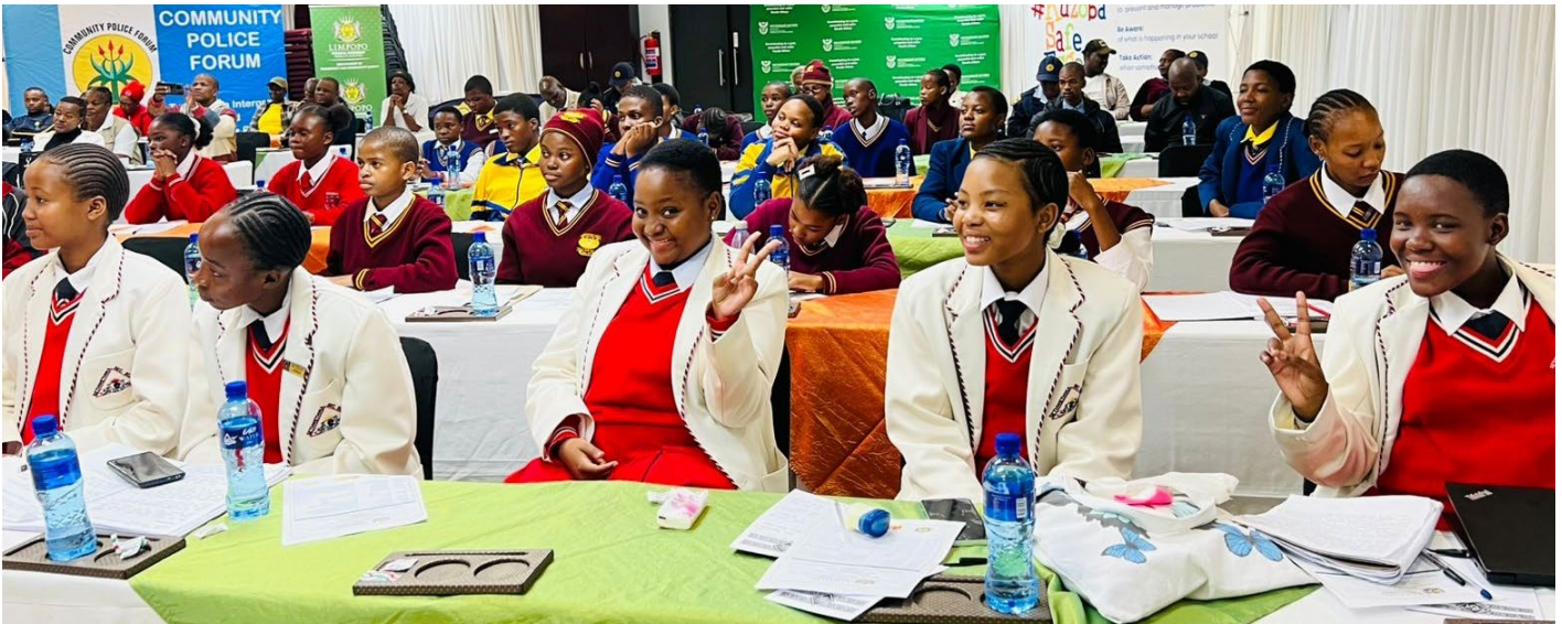
Learners from different schools awaiting to debate during the competition.