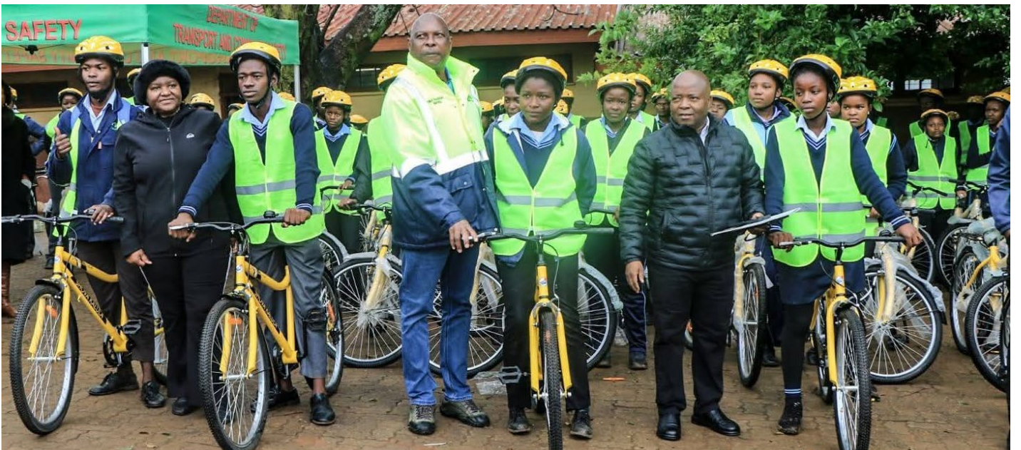
Learners of Rivubye Secondary School receiving the Shova Kalula Bicycles.