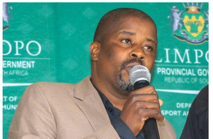
Mashau Traditional Council Representative.