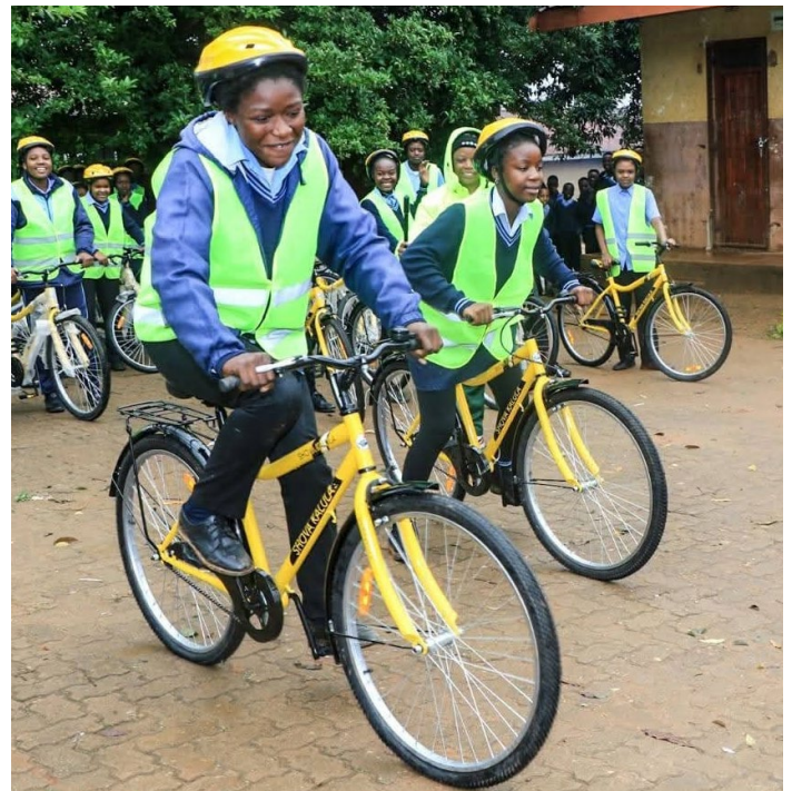
Learners of Rivubye Secondary School riding Shova Kalula Bicycles.

Until then, ride safe, study well, and remember: the road to success starts with showing up.