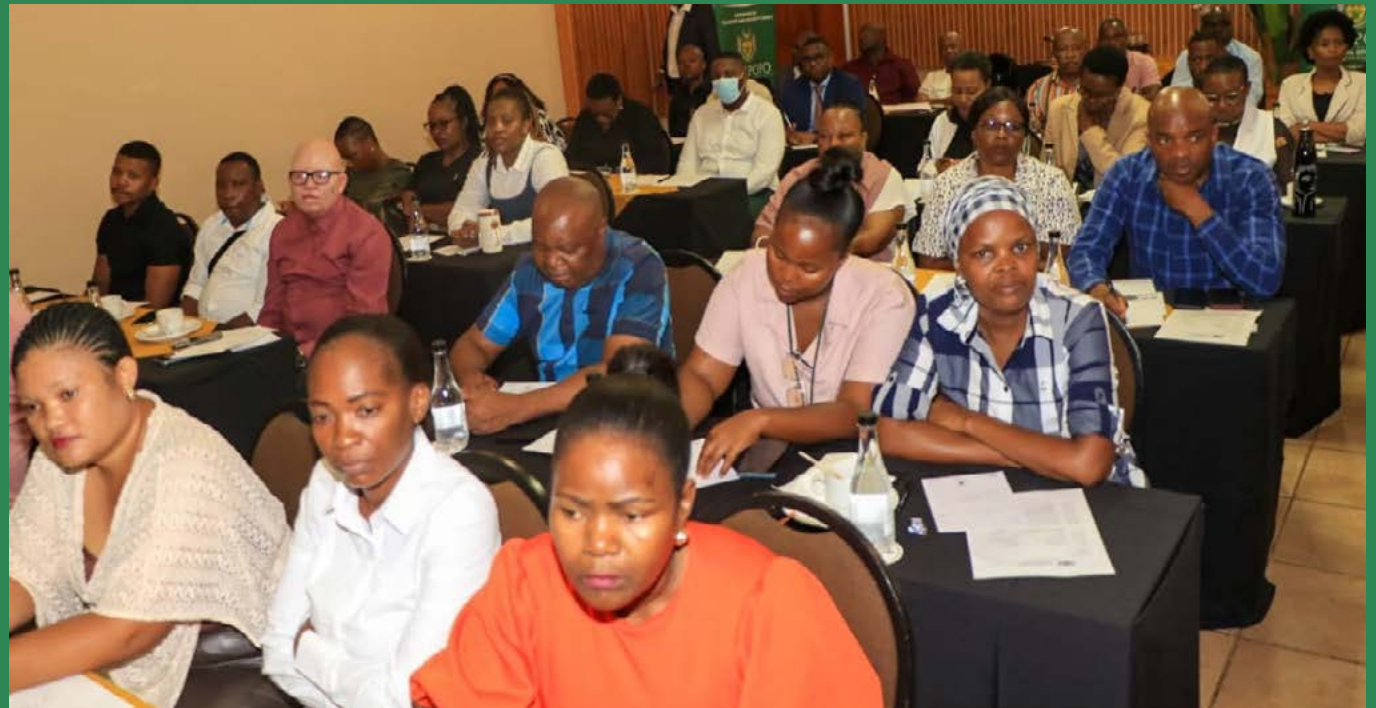
New employees of the Department of Transport and Community Safety.