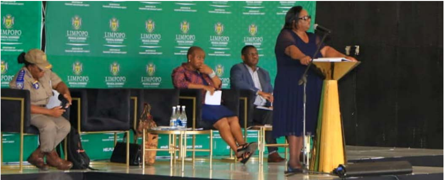
MEC Violet Mathye during engagement with Vhembe and Mopani staff members.