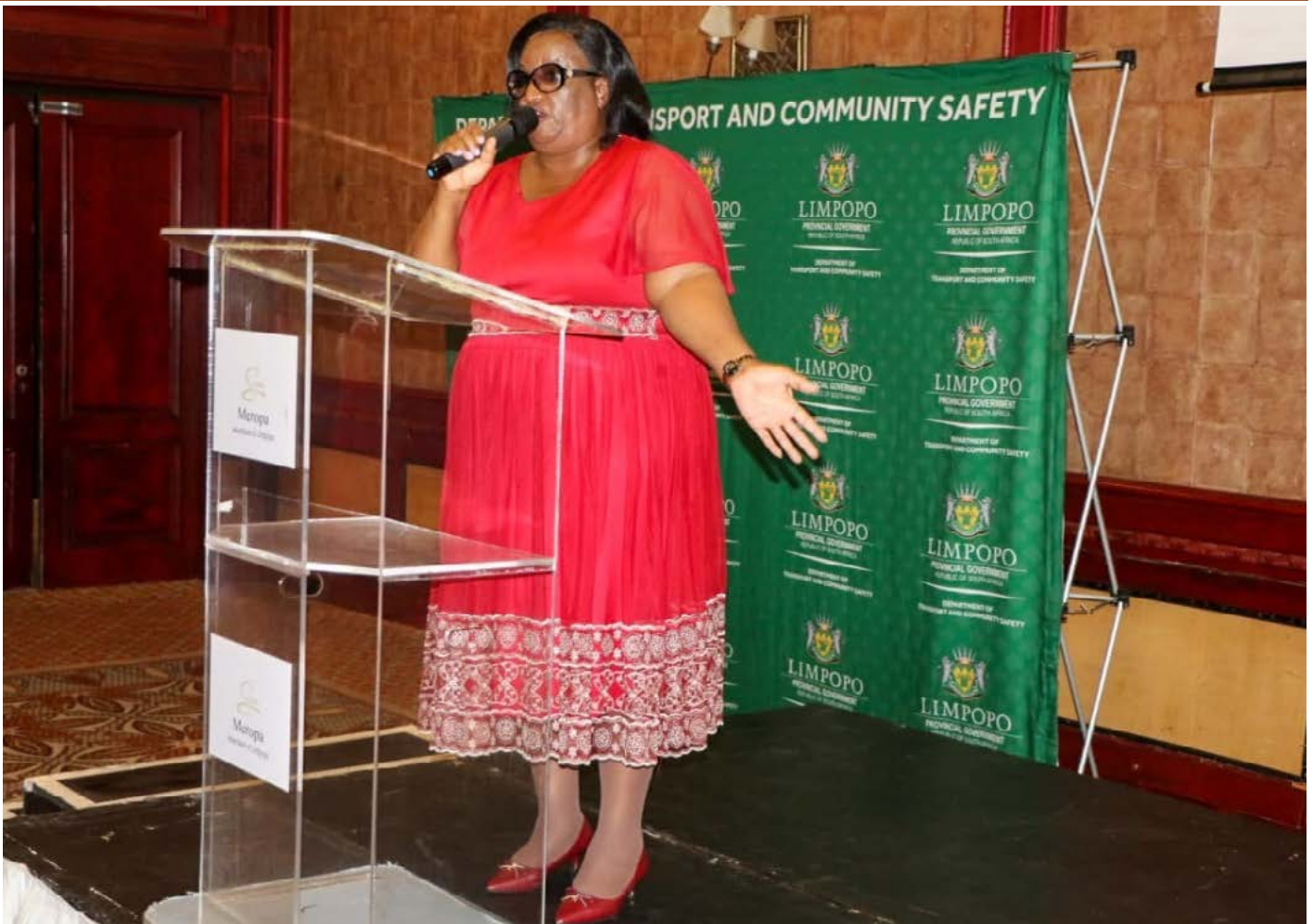
MEC Violet Mathye addressing employees at the Departmental Older Persons Celebration.