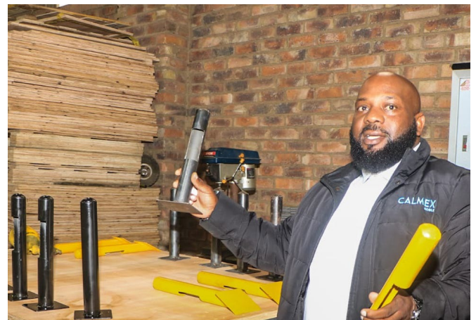
Calmex Mobile Representative demonstrating how the system works .

“This is more than technology, It’s about restoring trust in public transport. With FAT completed and documentation signed off, the project now moves to deployment and piloting on selected routes. The Department expects the system to be fully operational in phases over the coming months, with training for operators and officials running alongside. For the commuter waiting at a rural stop at dawn, the promise is simple, A bus that comes when it should, a ticket that counts, and a system that can prove it ”, Mainganye added