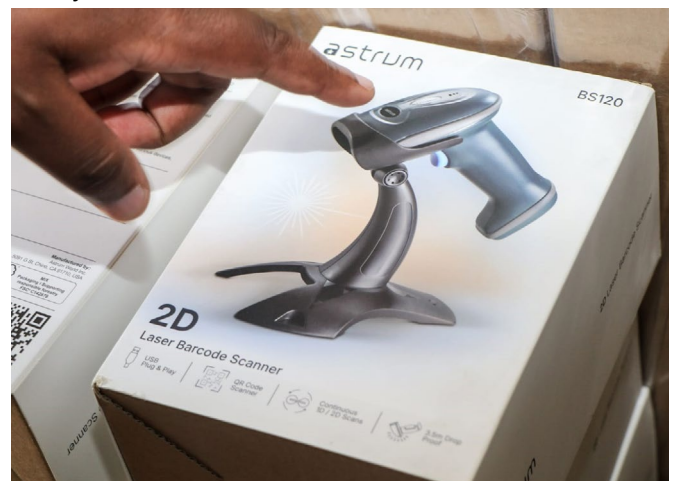
Laser Scanner Machine.