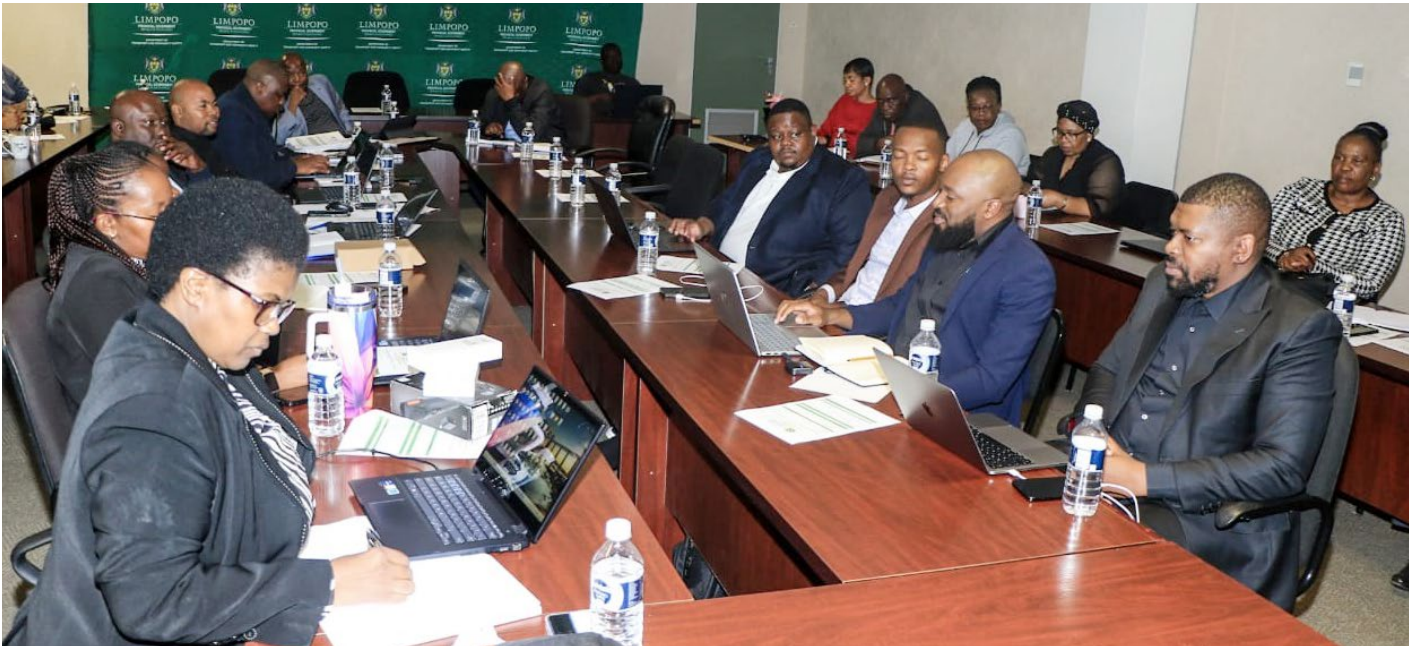
Limpopo Public Transport Integration Committee members during the meeting.