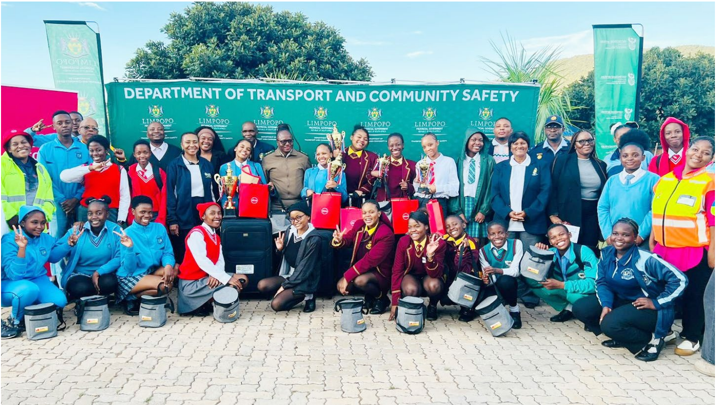
The top 5 winners (back-row center), participants, organisers and adjudicators.

The Limpopo Department of transport and Community Safety successfully hosted the Sekhukhune District Community Safety Debate Competition on Saturday, 9 May 2026 in Burgersfort. It is the second district to host the 2026 edition.