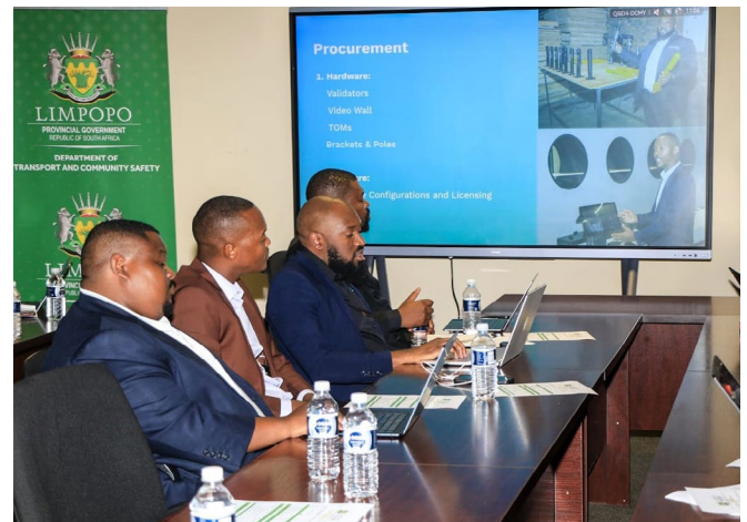
Presentations on Intelligent Transport System during the meeting.

The committee appreciates the initiative of the department as a move toward a transport system that meets people where they are: simpler at the point of use, smarter behind the scenes, and built to connect Limpopo's communities with less friction and more ease.