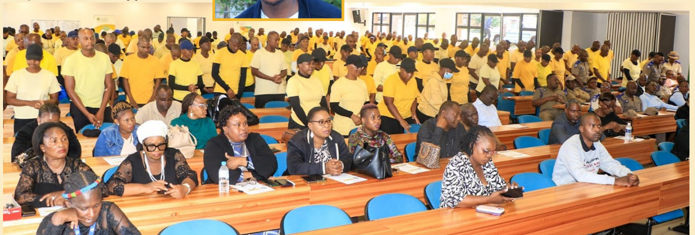
Fellow Traffic Students and Officials during the memorial service.