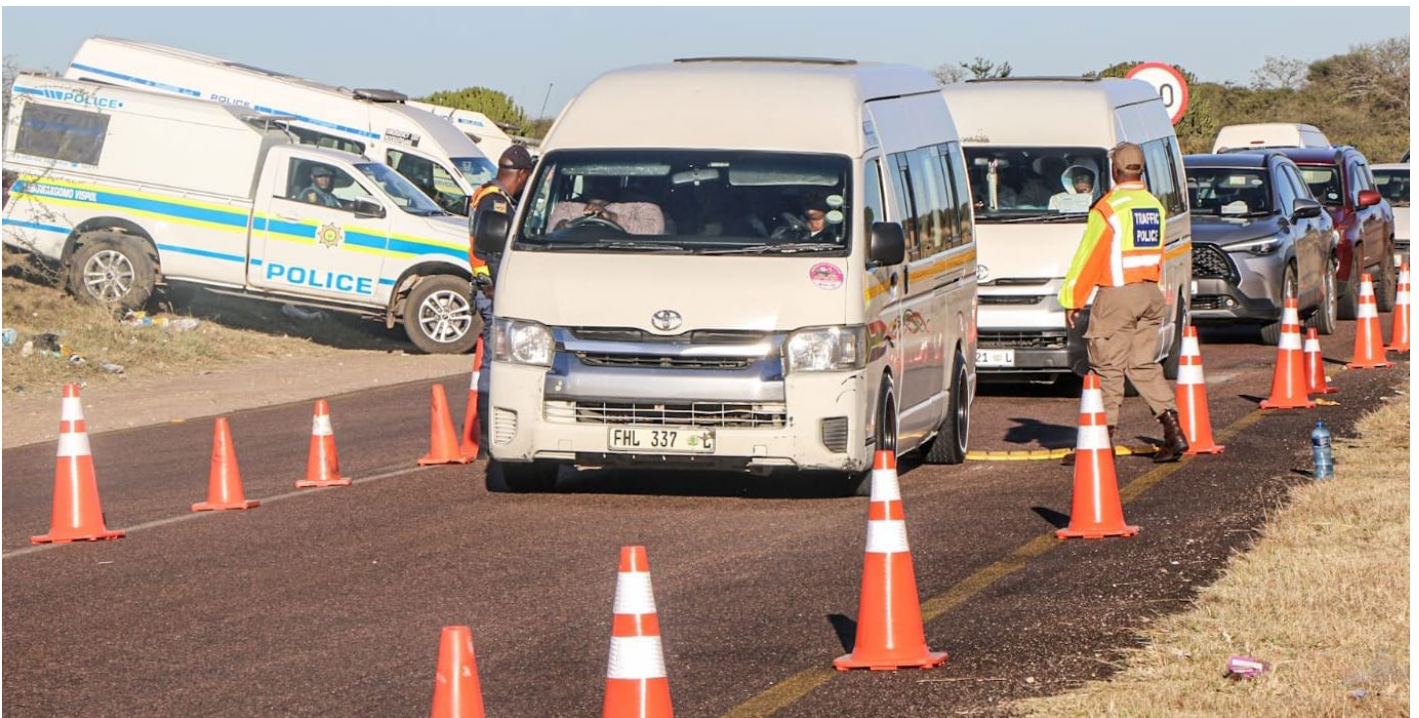
Motorists driving over the automated number plate recognition system.