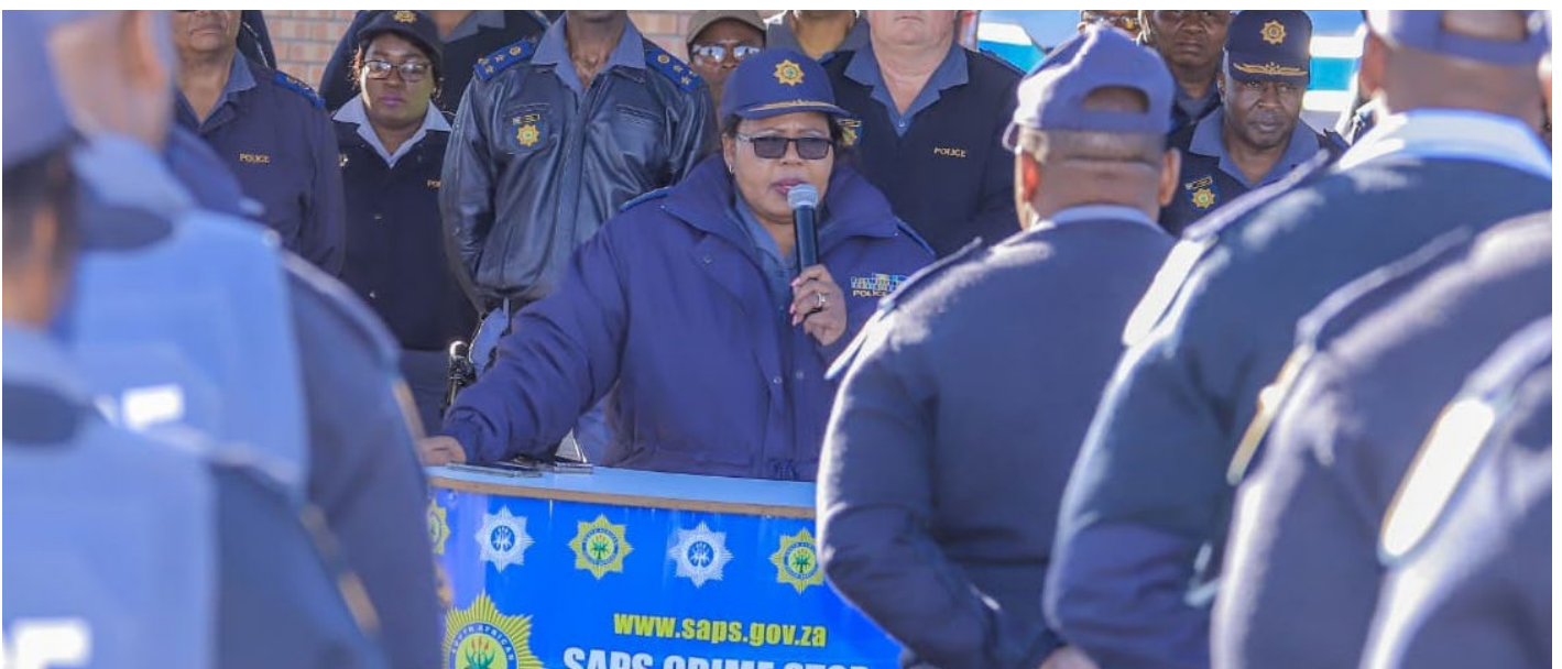
Lieutenant General Thembi Hadebe addressing SAPS members.