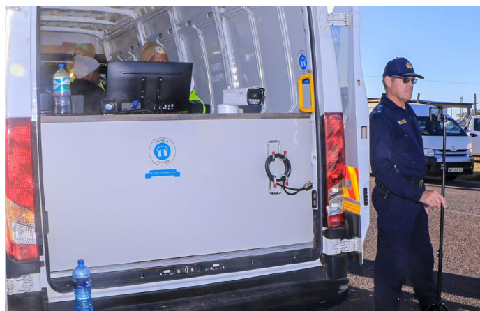
Automated Number Plate Recognition Vehicle.

At the parade, Lt. Gen. Hadebe turned her gratitude