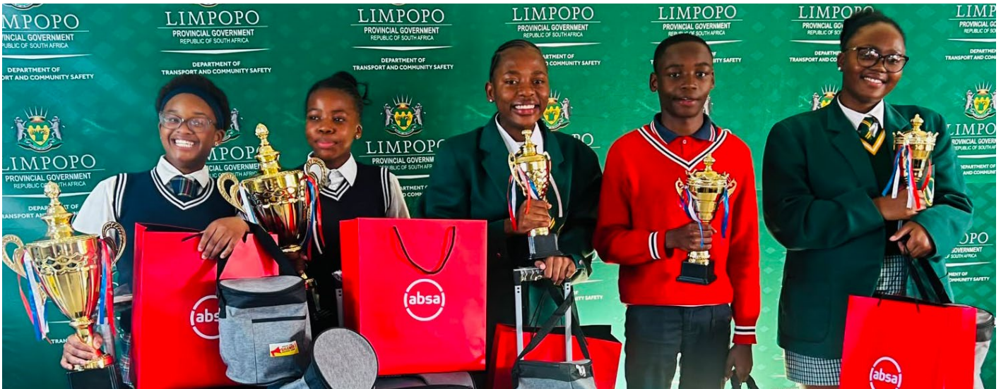
The top 5 winners who will represent Mopani District at the Provincial Community Safety Debate Competition.