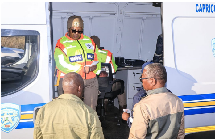
Motorists awaiting to settle their traffic fines.