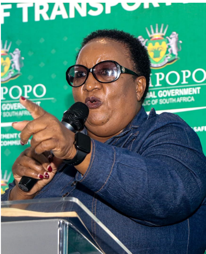
MEC Violet Mathye addressing attendees.