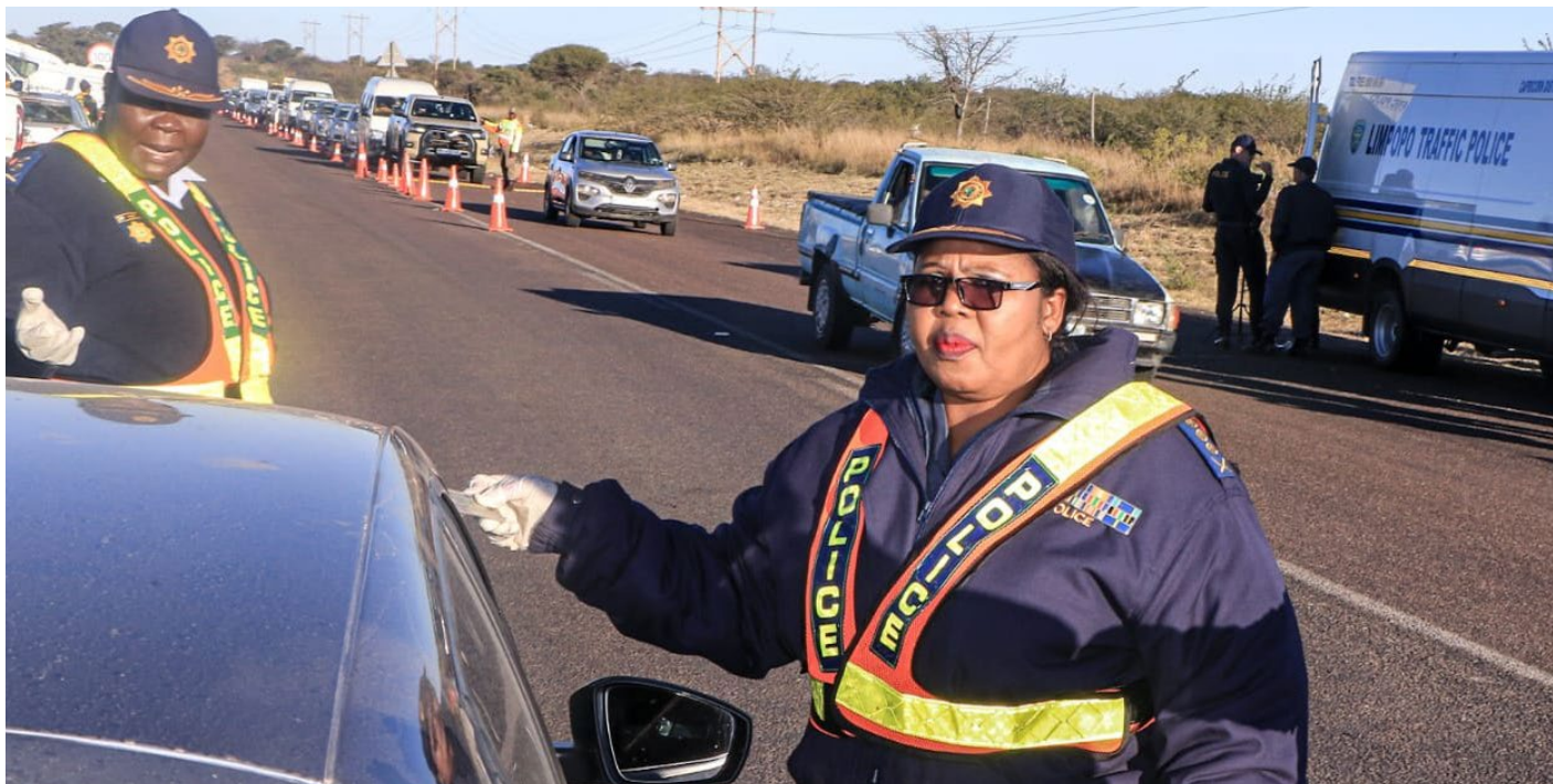
Provincial Commissioner, Lieutenant General Thembi Hadebe during the operation.