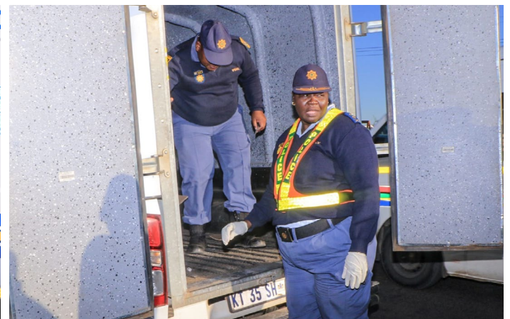
Major General Venetia Masingi searching vehicles.